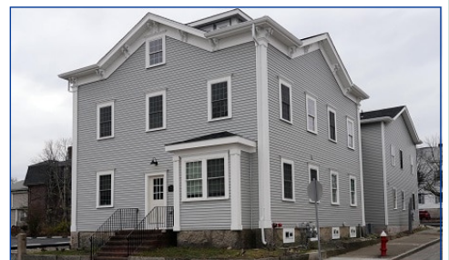
New Bedford, MA

Contact Lori at (508) 736-2387 or lorinery@comcast.net