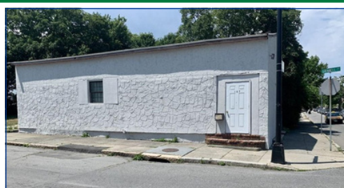
New Bedford, MA

FOR SALE! Multi-Use Opportunity for Office/Retail $154,500